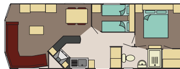
32 x 12 2 Bed