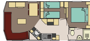
26 x 12 2 Bed