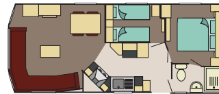
29 x 12 2 Bed