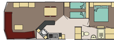
35 x 12 2 Bed