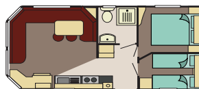
24 x 12 2 Bed