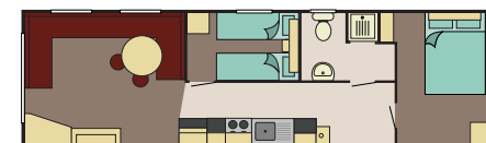
35 x 10 2 Bed