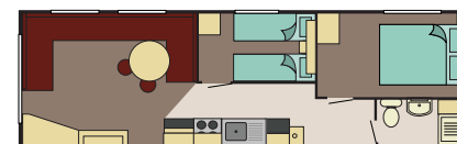
32 x 10 2 Bed