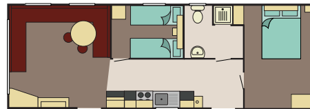
35 x 12 2 Bed