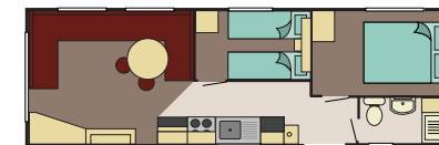
30 x 10 2 Bed