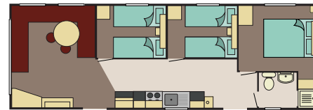
35 x 12 3 Bed