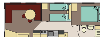
28 x 10 2 Bed