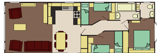
40 x 13 3 Bed